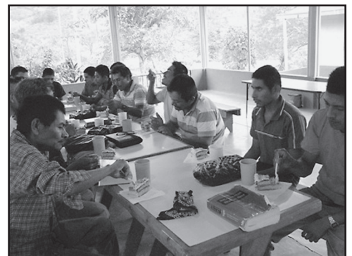
Men's Ministry in Guatemala

Again, thank you for all you do for our family here, and thank you for what you do for the families here in Guatemala as well. Please continue to pray for the ministry and for each precious life here. Also pray that our eyes and ears will be open to the leading of the Lord. We love you and we miss you! www.globalmissionsofmercy.com